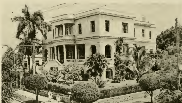
Colegio Buenavista, Havana, typifies Protestant education in Latin America

The outstanding example is in Montevideo, Uruguay, where Crandon Insti-